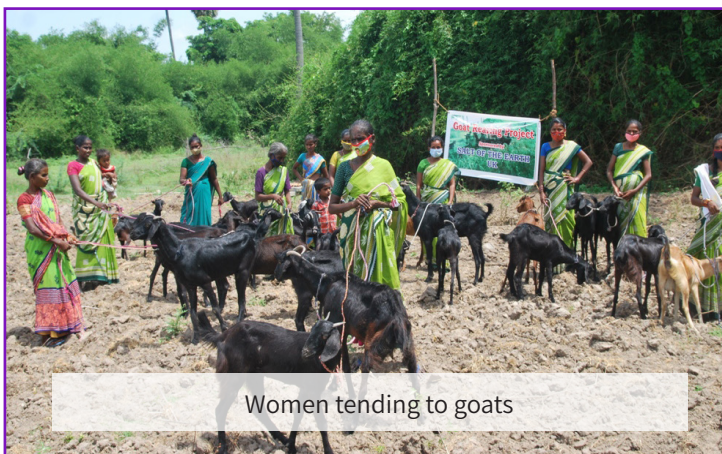
Women tending to goats

At CARE, who support the Landor begging community, we have funded a goat income generation scheme designed to overcome the need for begging. Over a year ago we paid for the purchase of 30 nanny goats and two billy goats to be distributed to ten families who had previously been trained in goat rearing. Each family are raising kid goats and, after giving back one kid goat to the scheme for the use of further families, sell the remaining kid goats. The scheme is designed to be self-sustaining and is growing.