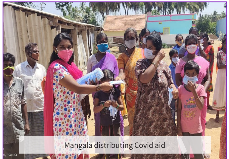
Mangala distributing Covid aid