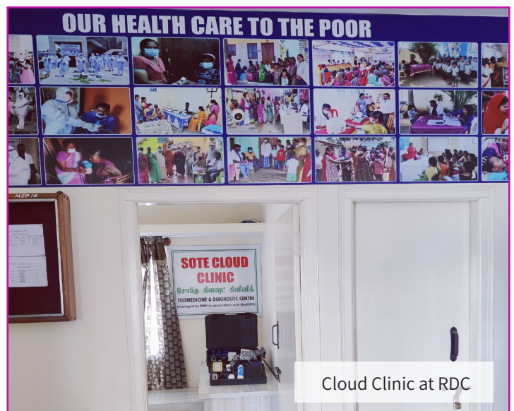
Cloud Clinic at RDC