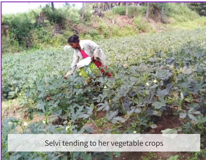
Selvi tending to her vegetable crops

Selvi has been vital in supporting women who suffer from domestic violence and has given victims the confidence to travel to SOTE's Women's Refuge for counsel. She collects data for tree planting, health projects, and village sponsorship and distributed food aid during the covid-19 pandemic.