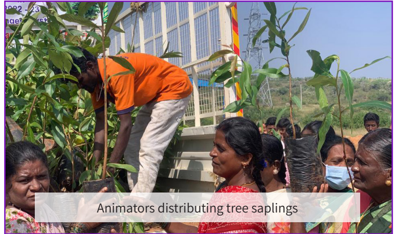
Animators distributing tree saplings

Animators demonstrate great eagerness for the work they do and care deeply about the welfare of people in their communities. We and our NGOs in South India are invested in these women, and these women are invested in their communities. Here are just a few of the women implementing SOTE support in rural India.