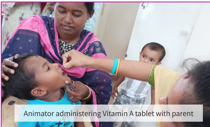
Animator administering Vitamin A tablet with parent

The cloud clinic has two staff members dedicated to the service, and all 15 animators have been trained in supporting the project at a village level. Online consultations are more in-depth than that of the mobile clinic. Animators work with online doctors to take diagnostic tests, and support patients with after-care.